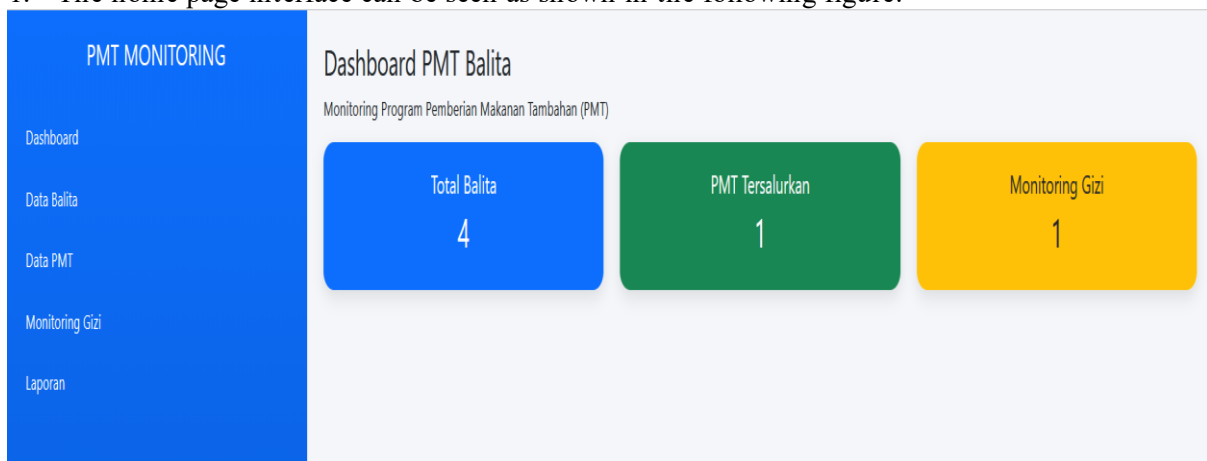
Figure 2 Halaman Home

At the system testing stage, the home page interface is implemented as part of the Web-Based Monitoring and Reporting System for Supplementary Feeding (PMT) for Toddlers in Karang Rejo Village. This page serves as the main interface that provides access to toddler data management, PMT monitoring, and report generation features for authorized users.